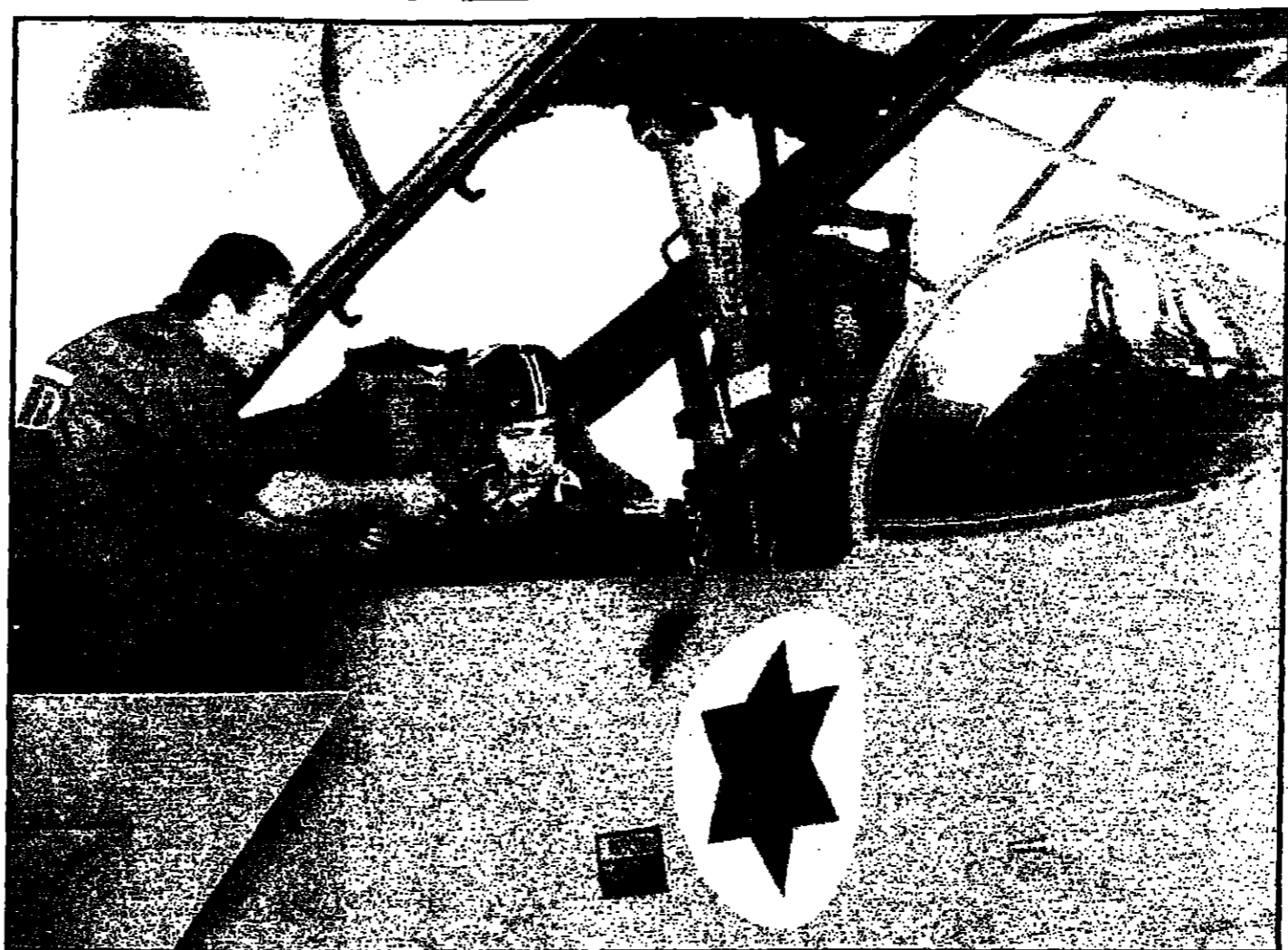
Prime Minister Binyamin Netanyahu is assisted by a ground crewman as he prepares to take his first supersonic flight in an air force F-15 yesterday.